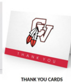
THANK YOU CARDS